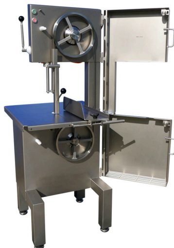
Illustration with optional sliding table